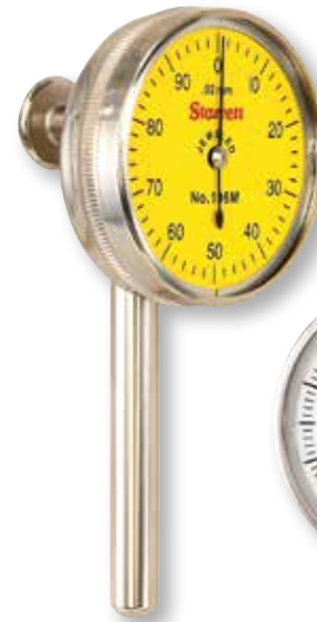
Left: 196MB1 Below: 196B1